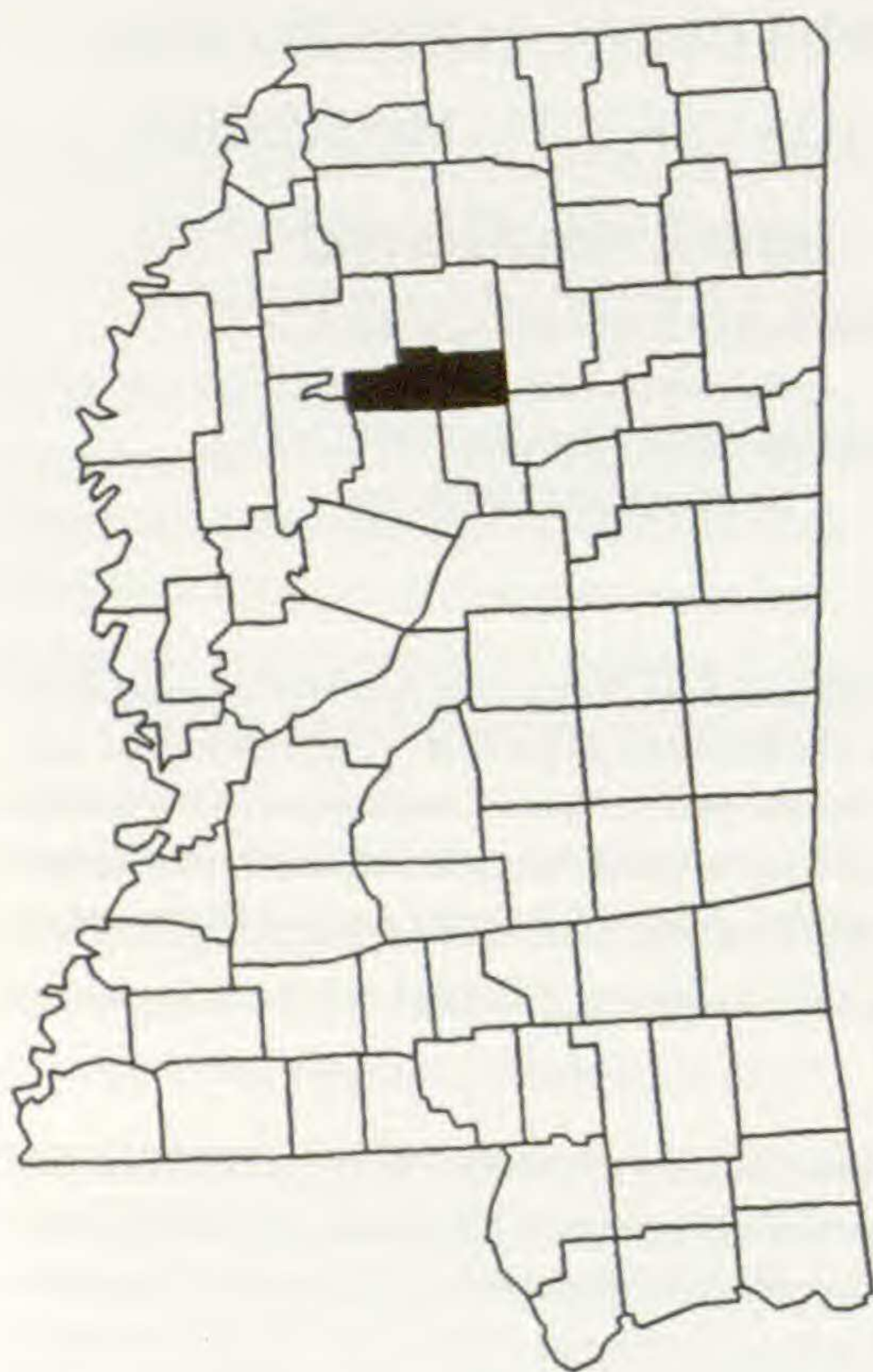
FIG. 1. Location of Grenada County, Mississippi.

level are located in the Yazoo-Mississippi Delta; a hill in the North Central Plateau of the southeastern part of the study area rises approximately 163.6 m (540 ft) above sea level. The two extremes of elevation give a total relief of 124.2 m (410 ft).